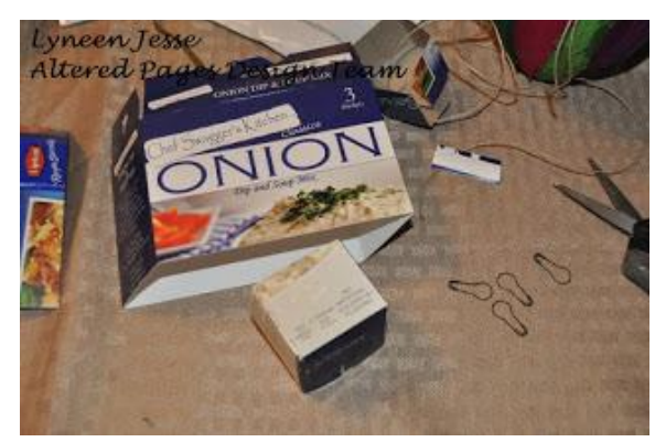
Make a box for the balloon basket! Here you can see I used a onion mix box.